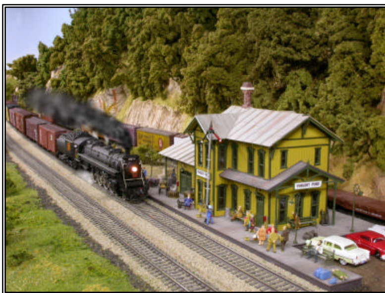
Right: A Canadian National freight approaches the station at Pungent Pond.

As you look around the layout you will note the numerous small detailed scenes that dot the landscape. David uses these effectively to draw the viewer's eye to a specific area. His attention to detail has led to such items as licence plates being applied to all of the motor vehicles on the layout. The scenery is hardshell with rock created from rubber molds. The trees are home built using various natural materials such as golden rod and sedum. Evergreens are made from bumpy chenille and lots of Woodlands Scenic ground foam is used for ground cover.