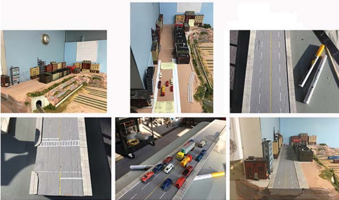
CN WESTON SUBDIVISION - TUNNEL ACCESS

THE TUNNEL ON THE LAYOUT IS ACCESSED BY A LIFT OUT ROAD. THIS GAVE US THE OPPORTUNITY TO TRY OUT SOME "WOODLAND SCENIC" ROAD MARKER PENS. ALONG WITH THE EVERGREEN TILE SHEETS USED FOR SIDEWALKS, AS SUGGESTED BY THE GUYS AT PANTHER HOBBIES, THE RESULT WAS VERY SATISFYING. MY HANDS ARE GETTING A LITTLE SHAKY THESE DAYS, BUT WITH THE HELP OF A RULER, THE WORK WAS FAST AND EASY. THE CROSS WALK IS AT THE BACK OF THE ROAD AGAINST THE WALL SO I USED IT AS A CHANCE TO TRYOUT A LITTLE MORE CREATIVE WORK LIKE THE CROSSWALK.